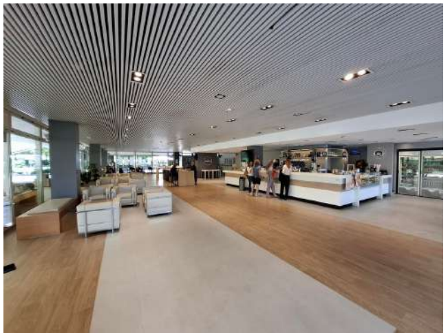
International Training Centre of the ILO · International Labour Organization, in Viale Maestri del Lavoro, 10, Turin Pavilion Restaurant, bar and lounge area