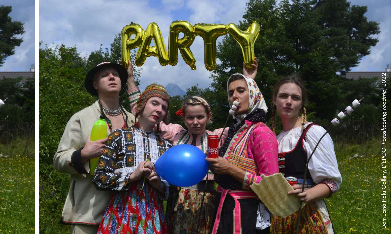
Dom Jana Hálu Gallery, DEPOG, Fotoshooting roadtrip, 2022.