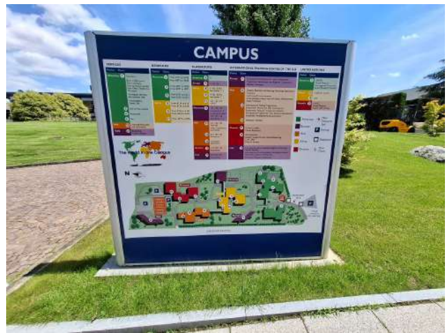
International Training Centre of the ILO · International Labour Organization, in Viale Maestri del Lavoro, 10, Turin. Outdoor Area